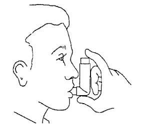
C. Put the inhaler in your mouth. Do not use for steroids.